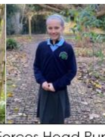
Forces Head Pupil